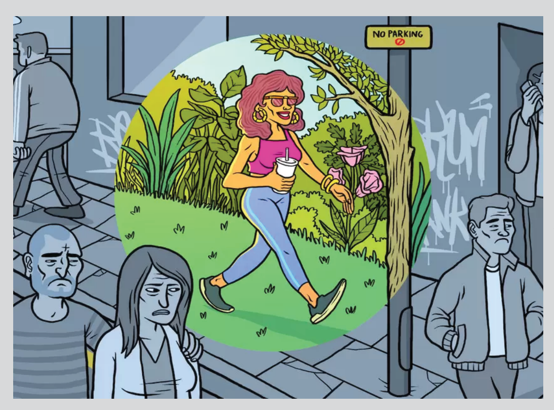
Figure 1: Research is growing that supports the positive mental-health effects of exposure to nature for individuals working and living in cities. Ecotherapy is gaining tranction as a field of research and is being considered by governments, health professionals, and labor forces around the world.