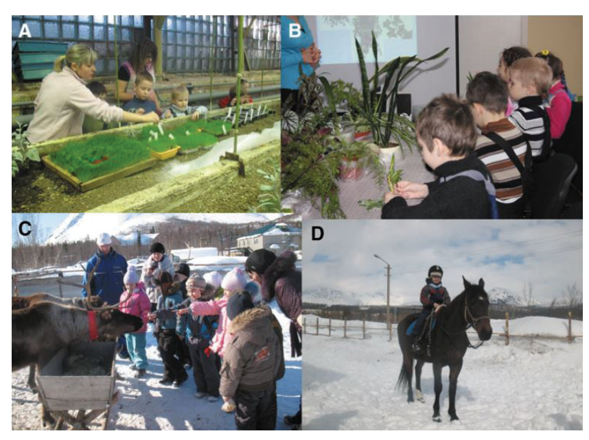
Figure 3: Integrated animaland plant-assisted ecotherapy programs designed for preschool children with speech disturbances resulted in better positive emotional background; reduced anxiety; higher intensity of cerebrum blood supply; increased observation keenness, self-reliance, and creativity; improved communication skills; improved skills of collective work; vocabulary enrichment; increased speech structure complexity (Kalashnikova 2016)

Extensive benefits come to child mental health from connection to animals: inpatient psychiatric children and adolescents show increased vitality, extraversion, and alertness; animals help highly aggressive children, emotionally disturbed, and handicapped children calm down and cooperate more while showing less antagonism and greater social competence; more social interactions and less physiological stress. (Chalquist 2009)